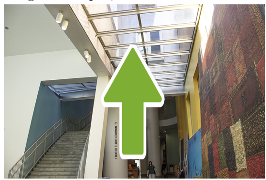
Figure 2: Output: "Go forward"