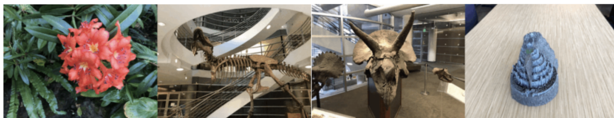
Figure 2: Click the image to play the video results. Please visit the official website to check out other stunning demos.

Given this representation, NeRF use classic rendering techniques [2] to render the color of a pixel. To optimize the radiance field, NeRF minimizes the squared loss between the ground truth pixels and the corresponding rendered pixels. The results are shown in Figure 2.